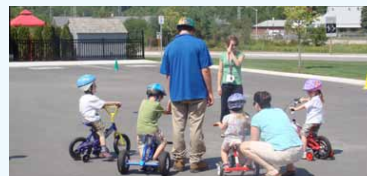
One Kids Place is a proud member of the Ontario Association of Children's Rehabilitation Services (OACRS).

One Kids Place (OKP) Children's Treatment Centre (CTC) is an integrated multi-service agency that provides a range of rehabilitation services to children and youth with special needs and their families. The Centre enhances child and youth development by focusing on the strengths and potential of individuals and families.